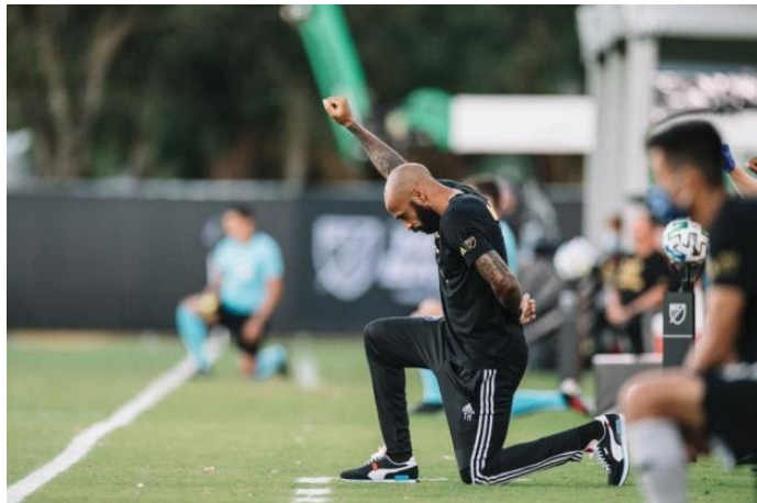
Thierry Henry on his knee on the ground.