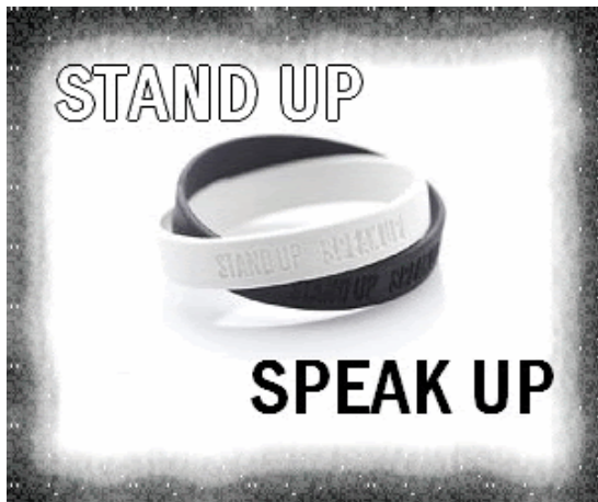
Bracelets sold for the Belgian association.