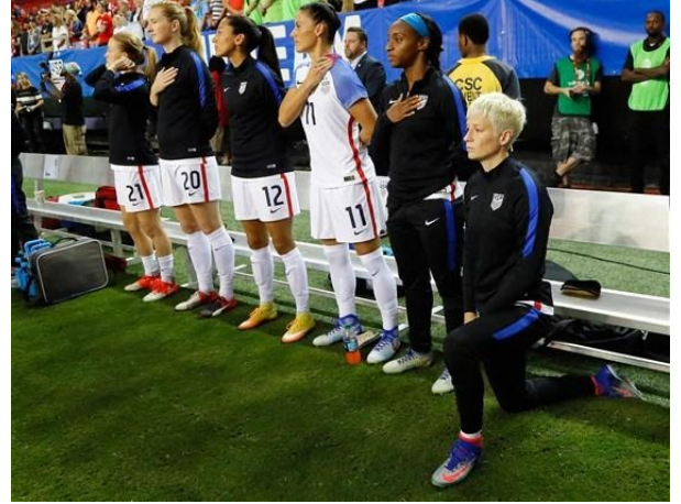
Megan Rapinoe kneels during the national anthem before the United States women's national soccer team played the Netherlands in Atlanta on September 18, 2016.

Megan Rapinoe is an American international football player and she was born on August 17 th 1985. She and her team won the Olympics in 2012 and the World Cup in 2015 and in 2019.