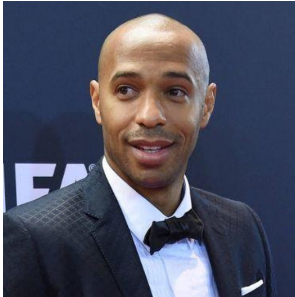
Thierry Henry French professional football coach.

Thierry Henry former footballer of the France team launches a campaign.