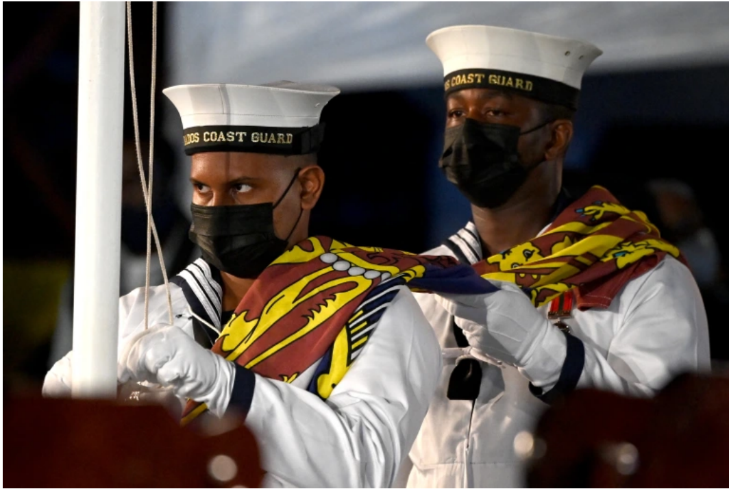
| The setting up of the new flag of Barbados

The Barbadian government has taken the decision to change some important symbols such as the portraits of Queen Elizabeth II which will be removed from government buildings and replaced with portraits of Barbadians painted by Barbadian artists. Besides, the Queen's royal flag was removed from the presidential inauguration ceremony in Heroes Square in Bridgetown and replaced with the new national flag of Barbados.